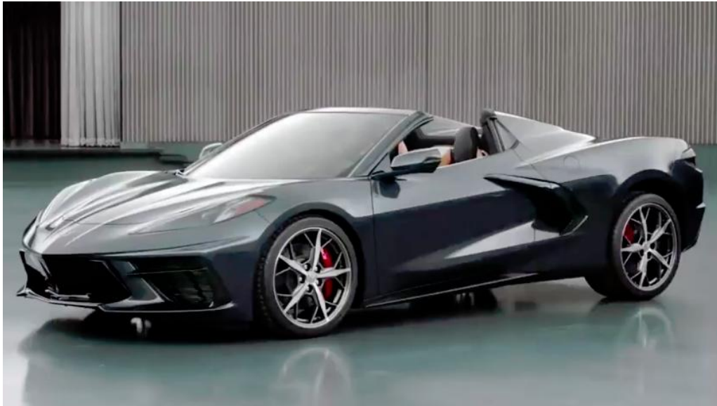
C-8 Corvette Convertible